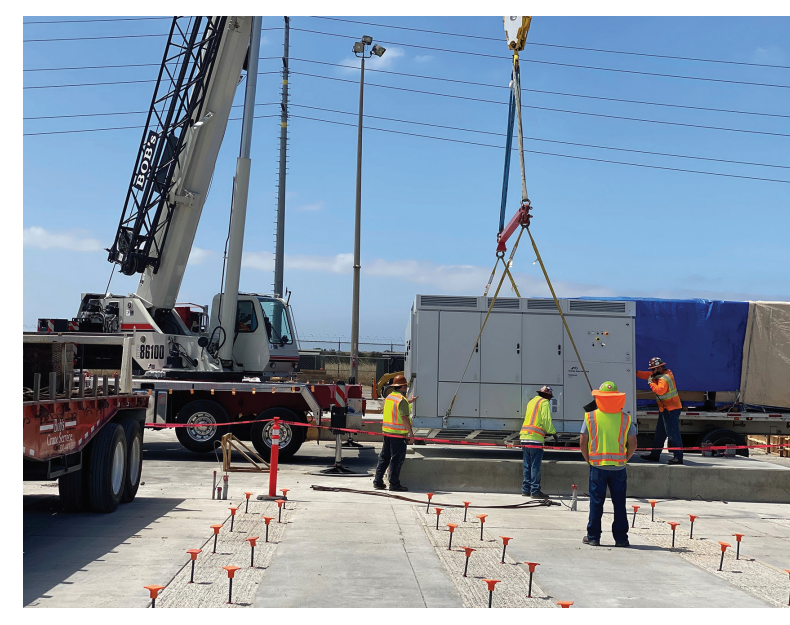
Construction of the Top Gun Energy Storage facility, which is expected to be operational in June 2021.

Top Gun Energy Storage is so named because it is located near Marine Corps Air Station Miramar, former home of the Top Gun naval aviation training program.