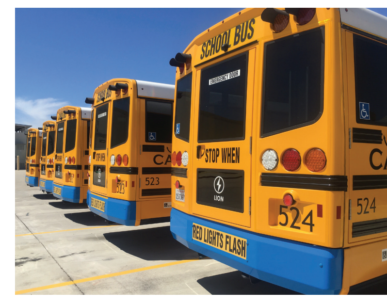
SDG&E is piloting vehicle-to-grid (V2G) technology with electric school buses at the Cajon Valley Union School District.

When: In March, SDG&E energized the first EV chargers built under Power Your Drive for Fleets. Expect to complete the program by end of 2026.