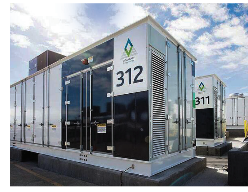
In 2017, SDG&E built what was then the largest lithium-ion battery (30MW/120MWh) in the City of Escondido.

When: Groundbreaking is imminent and completion expected in late 2021 / early 2022.