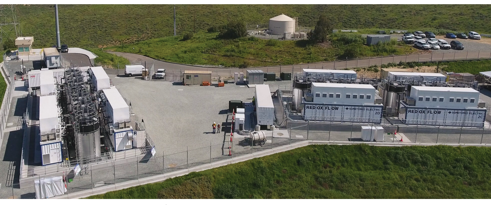
SDG&E's vanadium redox flow battery (2MW/8MWh) located in south San Diego County was the first battery of its kind to be connected to the CAISO market.